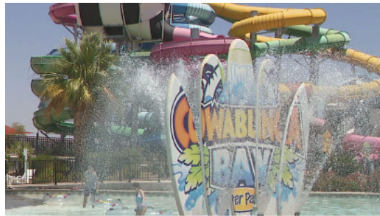
Special Olympics Nevada to host '2023 Las Vegas Plunge' at Cowabunga Bay.

I urge you to continue reporting the efforts you are doing to support the Special Olympics. Remember the Tootsie Roll Drive money raised through this effort goes toward supporting the Special Olympics.